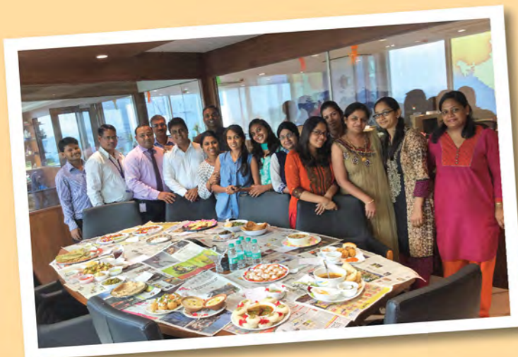
Dipawali Cooking Competition - 2015

As Seatech Continue spreading its wing all over India and recently at international level, quite few new faces had been inducted to our family in various locations as listed below. While we heartedly welcome them to our family, we sincerely hope that they too will join hands with others to our endeavor to achieve greater heights in years to come.