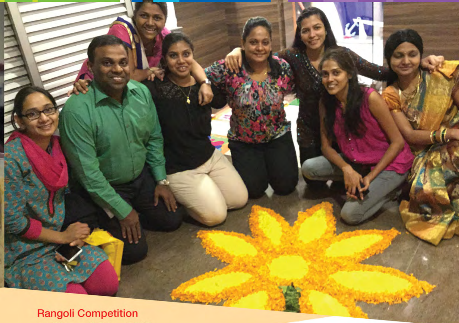
Rangoli Competition on Dipawali Day - 2015