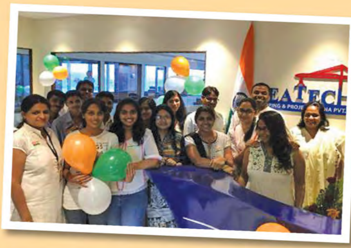
Independence Day Celebrations - 2015