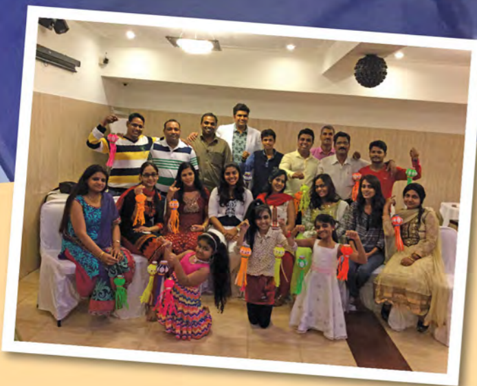
Dipawali Celebrations - 2015