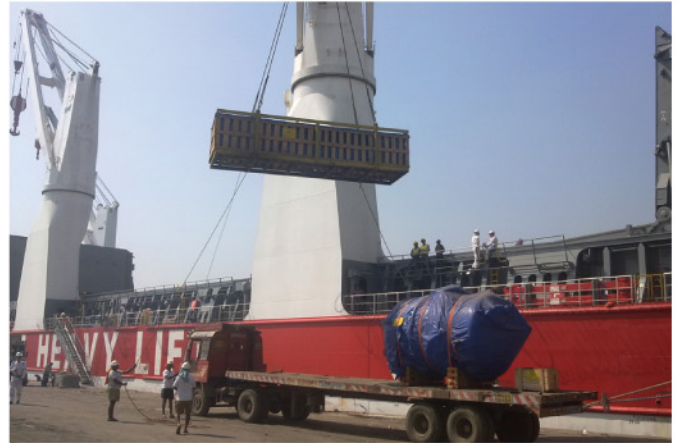
MV HLL Kobe which delivered cargoes in Richards Bay, Abidjan & Free town