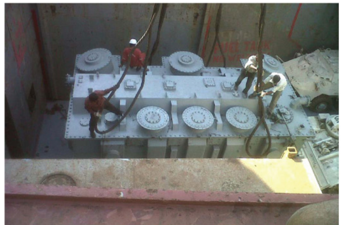
MV Thor Gitta delivered time bound cargoes from Richards Bay to Mumbai within a stipulated time of 18 days, for repair of transformers shipped mid feb to reach Mumbai first week march 7th and same transformers repaired by clients and fixed and delivered to consignee on mv vessel MV Han Ren.