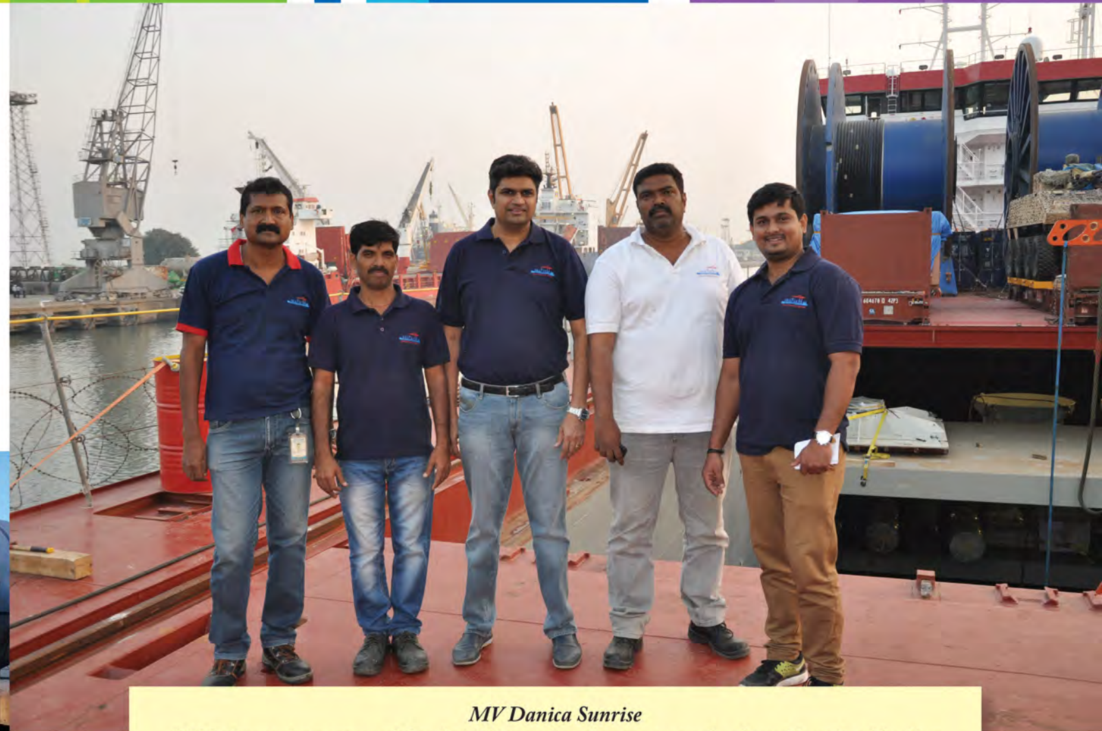
MV Danica Sunrise 2200 cbm projects cargoes, Mumbai / Sittwe, Loading commenced – dates, Completed loading